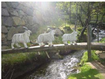
Trip trap over the bridge