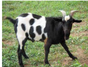
Middle Sized Billy Goat Gruff