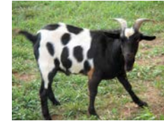
Little Billy Goat Gruff