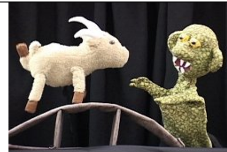
Who's that trip trapping over my bridge?

Cut and paste these pictures in the correct order in your book.